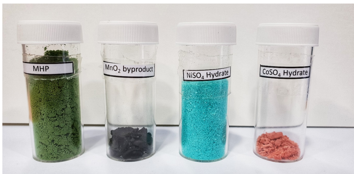
Figure 2: Nickel-Cobalt MHP from DNi™ Process (green) upgraded to produce Nickel Sulphate (blue), Cobalt Sulphate (orange-pink) and Manganese Dioxide (black)

Under laboratory ‘proof-of-concept’ conditions, CSIRO started with a nickel and cobalt MHP produced by the DNi™ Process and employed selective dissolution to create a nickel and cobalt rich liquor. This liquor was then subjected to solvent extraction to separate the nickel and the cobalt and remove impurity elements. Further purification and crystallisation was then utilised to produce the final nickel sulphate and cobalt sulphate products. In addition, a raw manganese dioxide product (one of the potential co-products under the DNi™ Process) was also produced (see Figure 2).