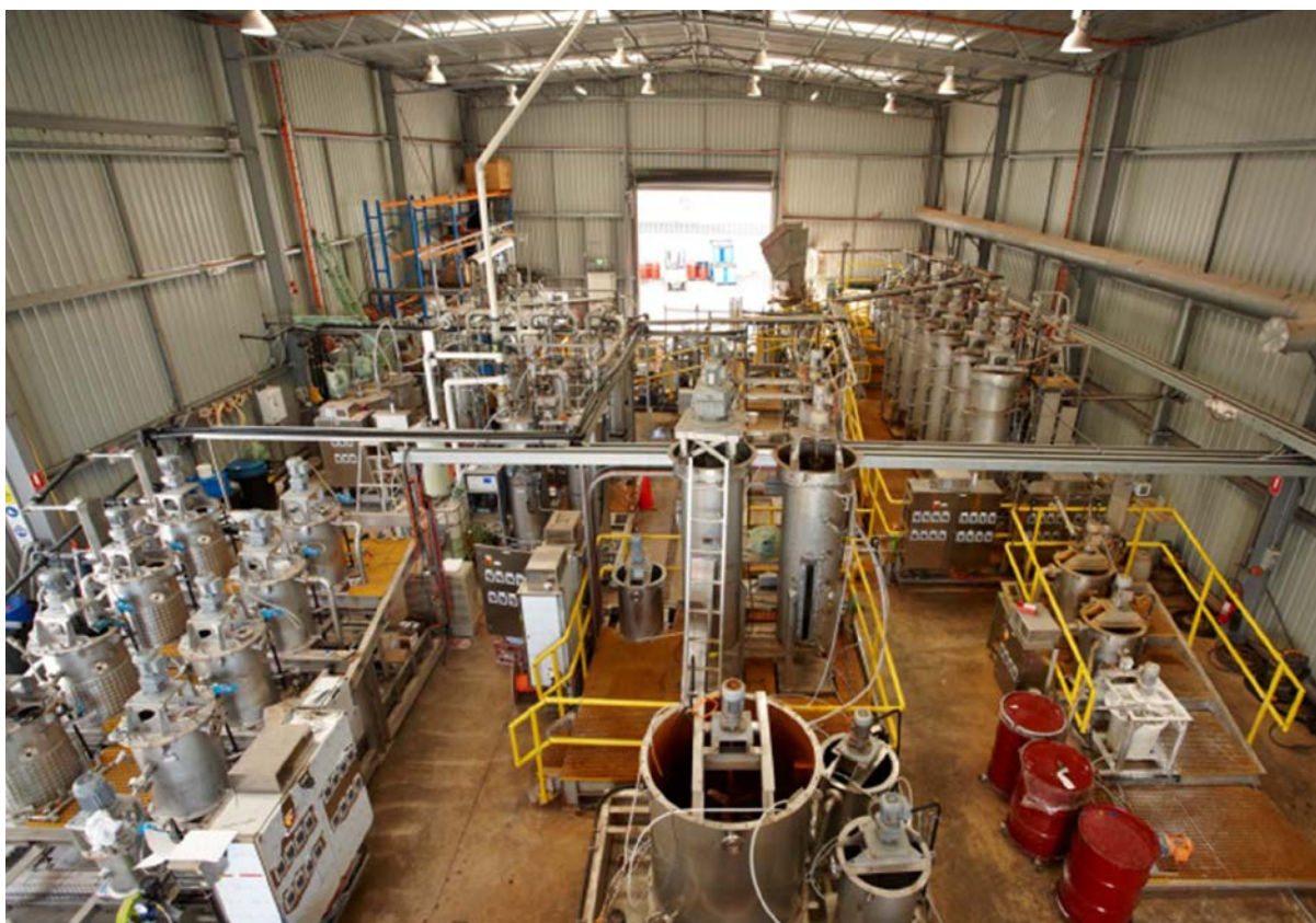
Fig 2. CSIRO Pilot Plant at Minerals Research Centre in Western Australia

The CSIRO Plant was designed and built to verify the DNi Process™ design and treat 1 tonne per day of laterite ore: