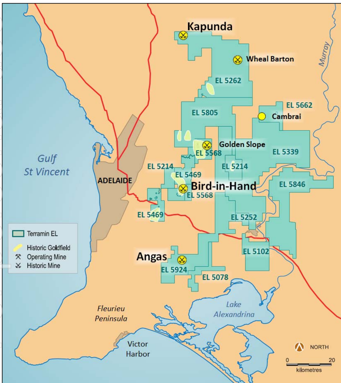
Figure 1. Kapunda located in Terramin's Adelaide Hills tenement package.

The recent advancements in ISR lixiviants and extraction technologies offer new methods that could be permitted to extract the copper. Kapunda has been considered a stranded deposit, with the Kapunda Mine historic site heritage listed and the proximity of the township of Kapunda. The ISR method is considered to be a viable method of extracting the copper in this location.