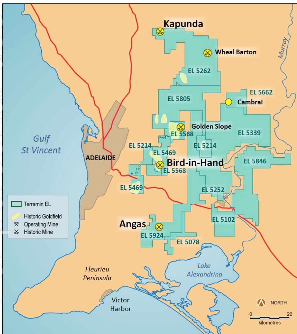
Figure 1. Kapunda located in Terramin's Adelaide Hills tenement package.

The recent advancements in ISR lixiviants and extraction technologies offer new methods that could be permitted to extract the copper. Kapunda has been considered a stranded deposit, with the Kapunda Mine historic site heritage listed and the proximity of the township of Kapunda. The ISR method is considered to be a viable method of extracting the copper in this location.