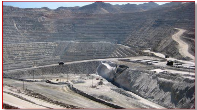
Cuajone Mine, Peru: 2.4Bt @ 0.48% Cu, 0.017% Mo; 140ktpa Cu production. 70km NE of Ilo Este.

Porphyry Copper Deposits are the world's largest source of copper mined today and are generally the lowest unit cost mines due to their size and additional bi-product credits for Mo, Au, Ag and other metals. Peru and Chile together produce around one third of the world's copper and the Western flanks of the Andes Mountains in Southern Peru are host to Peru's largest and most prolific copper producers. Nearly 600,000 tonnes of copper is produced each year within 100 km of Latin's concessions and is set to increase substantially in coming years with expansions and new mines coming on line. Latin's concessions have good potential for Copper Porphyry deposits and such a discovery would be extremely valuable to the Company.