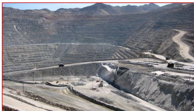
Cuajone Mine, Peru: 2.4Bt @ 0.48% Cu, 0.017% Mo; 140ktpa Cu production. 70km NE of Ilo Este.

Porphyry Copper Deposits are the world's largest source of copper mined today and are generally the lowest unit cost mines due to their size and additional bi-product credits for Mo, Au, Ag and other metals. Peru and Chile together produce around one third of the world's copper and the Western flanks of the Andes Mountains in Southern Peru are host to Peru's largest and most prolific copper producers. Nearly 600,000 tonnes of copper is produced each year within 100 km of Latin's concessions and is set to increase substantially in coming years with expansions and new mines coming on line. Latin's concessions have good potential for Copper Porphyry deposits and such a discovery would be extremely valuable to the Company.