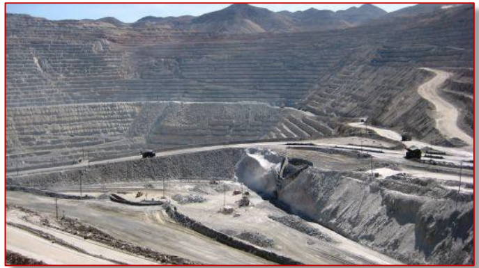
Cuajone Mine, Peru: 2.4Bt @ 0.48% Cu, 0.017% Mo; 140ktpa Cu production. 70km NE of Ilo Este.

Porphyry Copper Deposits are the world's largest source of copper mined today and are generally the lowest unit cost mines due to their size and additional bi-product credits for Mo, Au, Ag and other metals. Peru and Chile together produce around one third of the world's copper and the Western flanks of the Andes Mountains in Southern Peru are host to Peru's largest and most prolific copper producers. Nearly 600,000 tonnes of copper is produced each year within 100 km of Latin's concessions and is set to increase substantially in coming years with expansions and new mines coming on line. Latin's concessions have good potential for Copper Porphyry deposits and such a discovery would be extremely valuable to the Company.