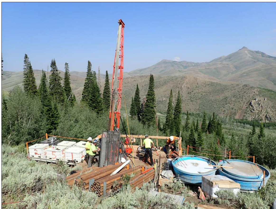
Figure 1: Drill rig at Beadles Creek

The drilling at Beadles Creek has been designed to test for shallow up-dip eastern extensions of the high grade zone intersected during the 2016 drilling campaign (Figure 2). A second drill rig will be mobilised to site shortly to commence drilling at South Sammy.