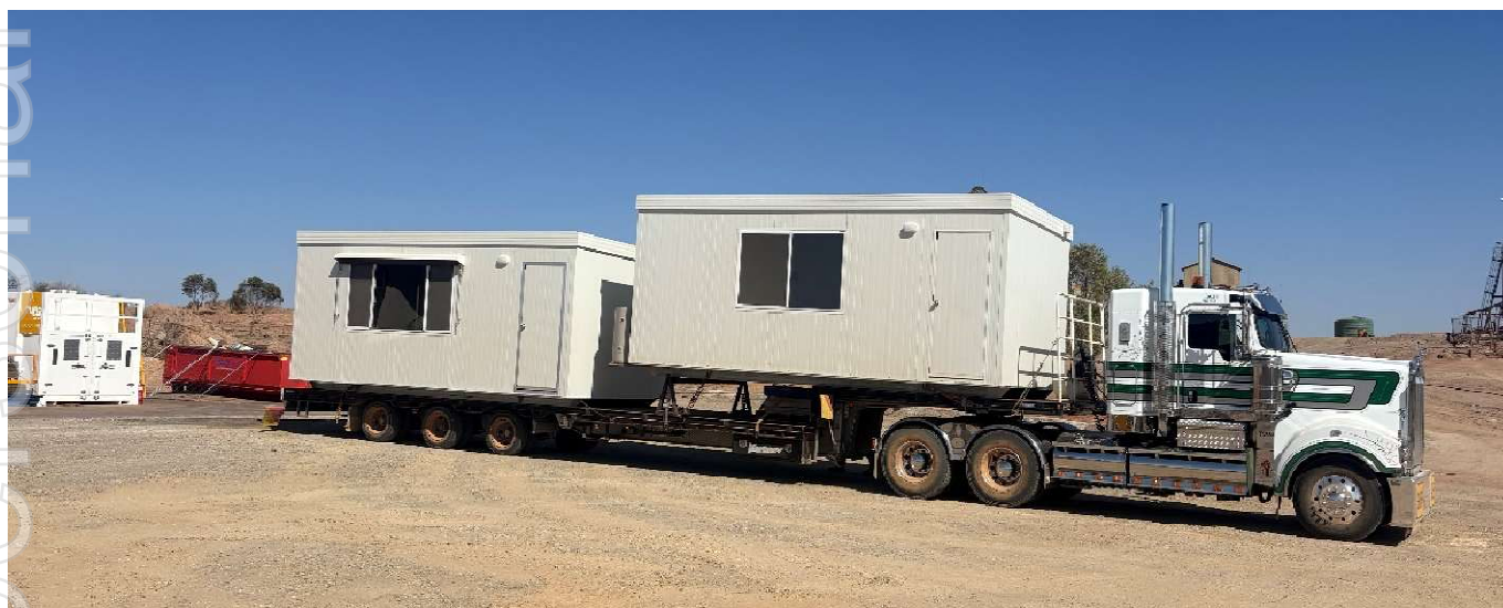
Figure 2 – Delivery of new office buildings to Pinnacles Mine

To support this increased level of activity, the Company has made several targeted operational and technical appointments, strengthening on-site capability across geology, processing and project delivery functions. These hires underpin capacity to execute the expanded drilling program, while enabling parallel progression toward mining operations targeted for the June Quarter 2026.