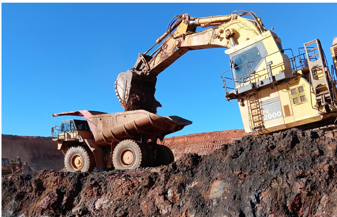
Figure 1: Very first bucket of ore being loaded at Lucky Strike

Lefroy Exploration Limited (“Lefroy” or “the Company”) (ASX: LEX) is pleased to provide a progress report in relation to mining at the Lucky Strike Gold Deposit near Kalgoorlie in Western Australia.