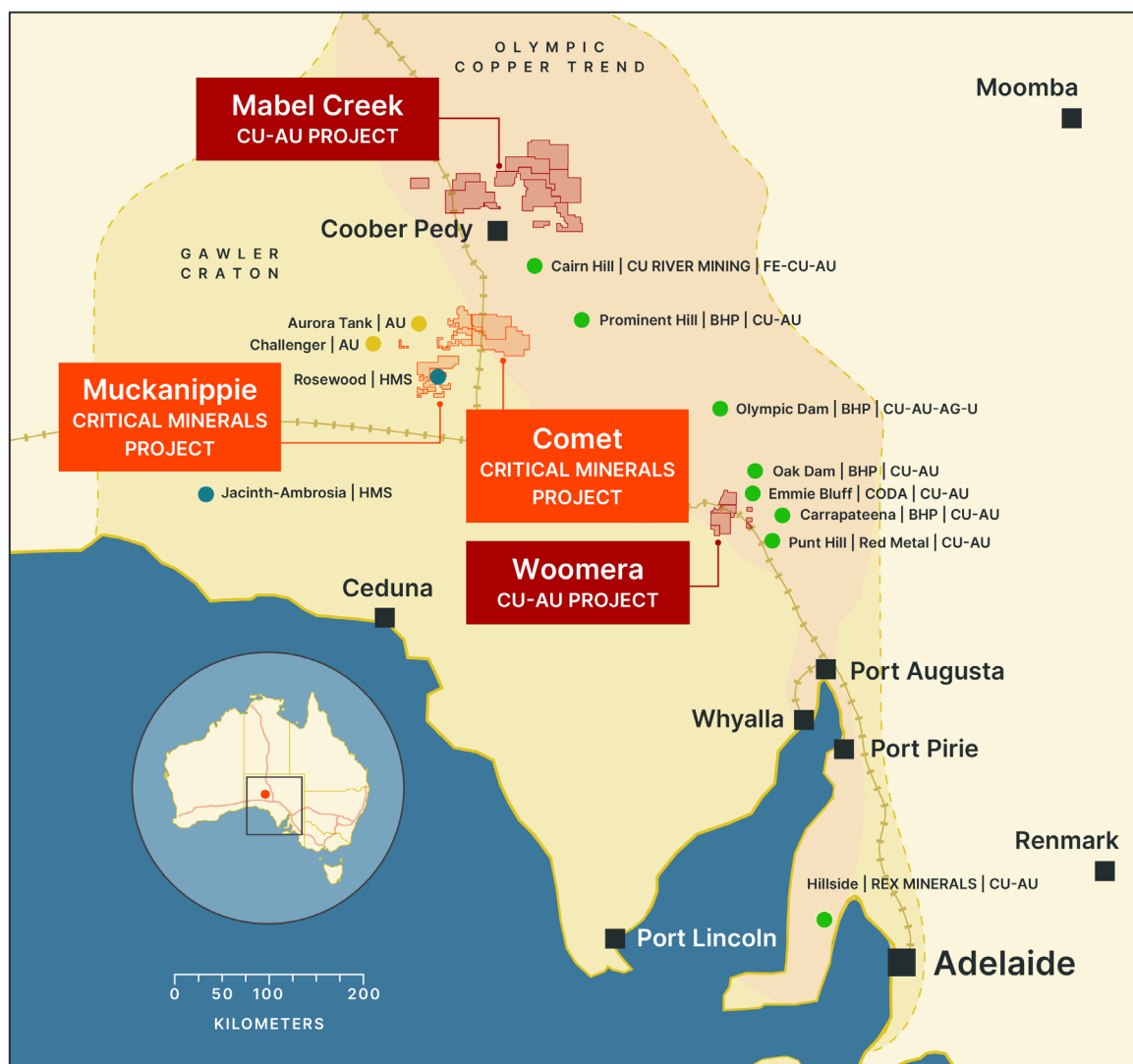
PTR Minerals' Project Locations in South Australia

The Company also has highly prospective copper, gold and rare earth projects. Its Woomera and Mabel Creek copper-gold projects are located in the world-class Olympic Copper-Gold Province of South Australia. Work has uncovered Iron-Oxide Copper-Gold style alteration/mineralisation and geophysical targeting work has identified several compelling Tier-1 Copper-Gold targets which are drill ready. The Company's Comet Project is historically noted for its numerous gold occurrences however early stage greenfields drilling has identified significant Rare Earths hosted in shallow clays over large areas, at 3 Prospect sites.