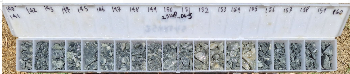
Figure 2: Chip tray photo of 140-160m in drill hole 25WR045. Note the consistent quartz veining from 142-155m with a significant vein at 151-155m.

Encouraging signs of mineralisation have been identified in numerous drill holes during the drill campaign, which NAE hopes will extend the high-grade gold along strike and at depth. Drill hole 25WR045 intercepted 13m of consistent quartz veining within an intrusive body (Figure 1), with associated sulphides (pyrite and pyrrhotite) and alteration (carbonate and chlorite), which is indicative of targeting success.