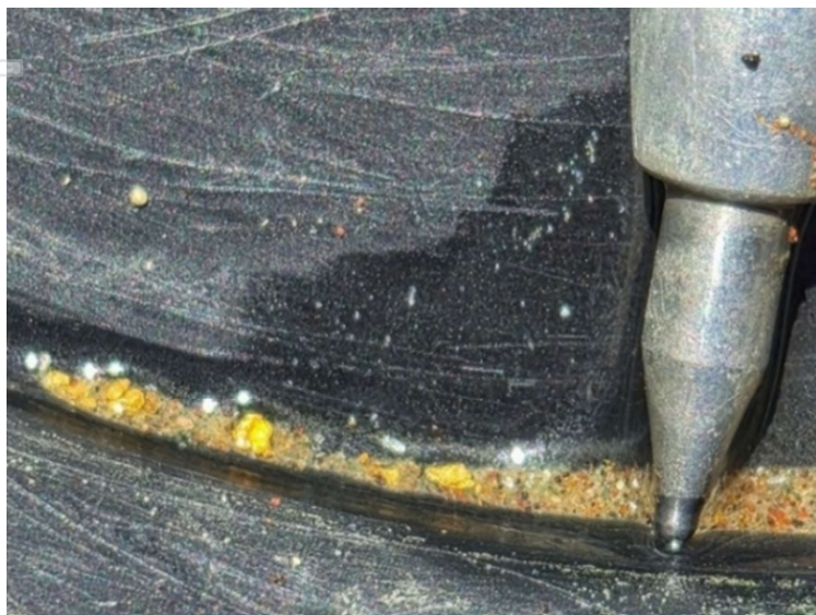
Figure 1. Visible gold panned from rock chips in previously reported Amy Clarke aircore hole 25ACAC007 from 11-12m which recorded an assay of 23.9 g/t gold from 10-12m downhole (scribe pen used for scale) 1 . Refer to GSN ASX announcement dated 6 November 2025.