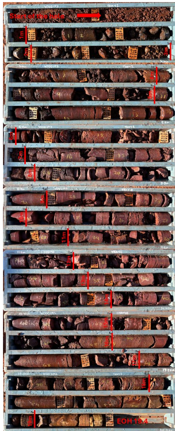
Figure 3. Drill hole WDDD197 twinning hole WDRC197 that intersected 13m @ 57% Fe from 3m including 6m @ 60.1% Fe from 10m. Assays quoted from the equivalent interval from WDRC197 to the twin diamond hole will vary due to geological variation and recovered core. Iron mineralisation can be observed from surface to 8m increasing grade with depth. Downhole metre marks are drawn on the core and tray ribs.