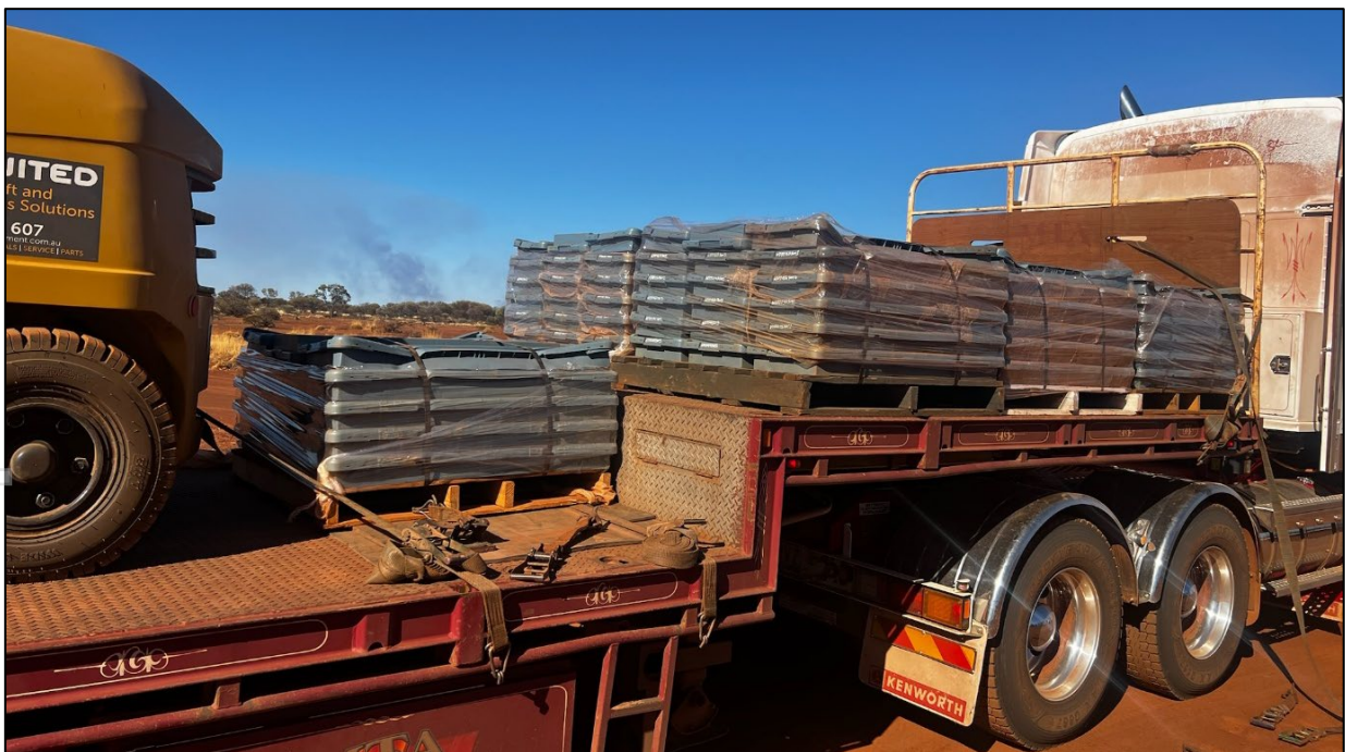
Photo 1. PQ3 core sample trays ready to be transported from site to Perth.

"The Company is now primed for an exciting 2026, as we continue to unlock the full potential of the unique Wandanya deposit and de-risk the project with more drilling and metallurgical studies."