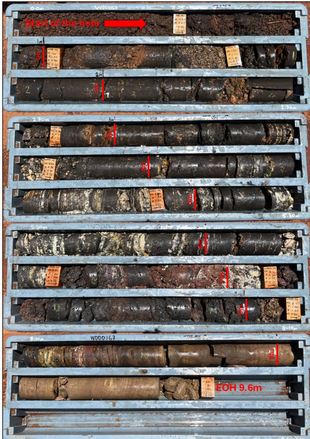
Figure 2. Drill hole WDDD167 twinning hole WDRC167 that intersected 7m @ 31.4% Mn from 0m including 3m @ 39.3% Mn Fe from 4m. Assays quoted from the equivalent interval from WDRC167 to the twin diamond hole will vary due to geological variation and recovered core. Manganese mineralisation can be observed from surface to 8m increasing grade with depth. Downhole metre marks are drawn on the core and tray ribs.