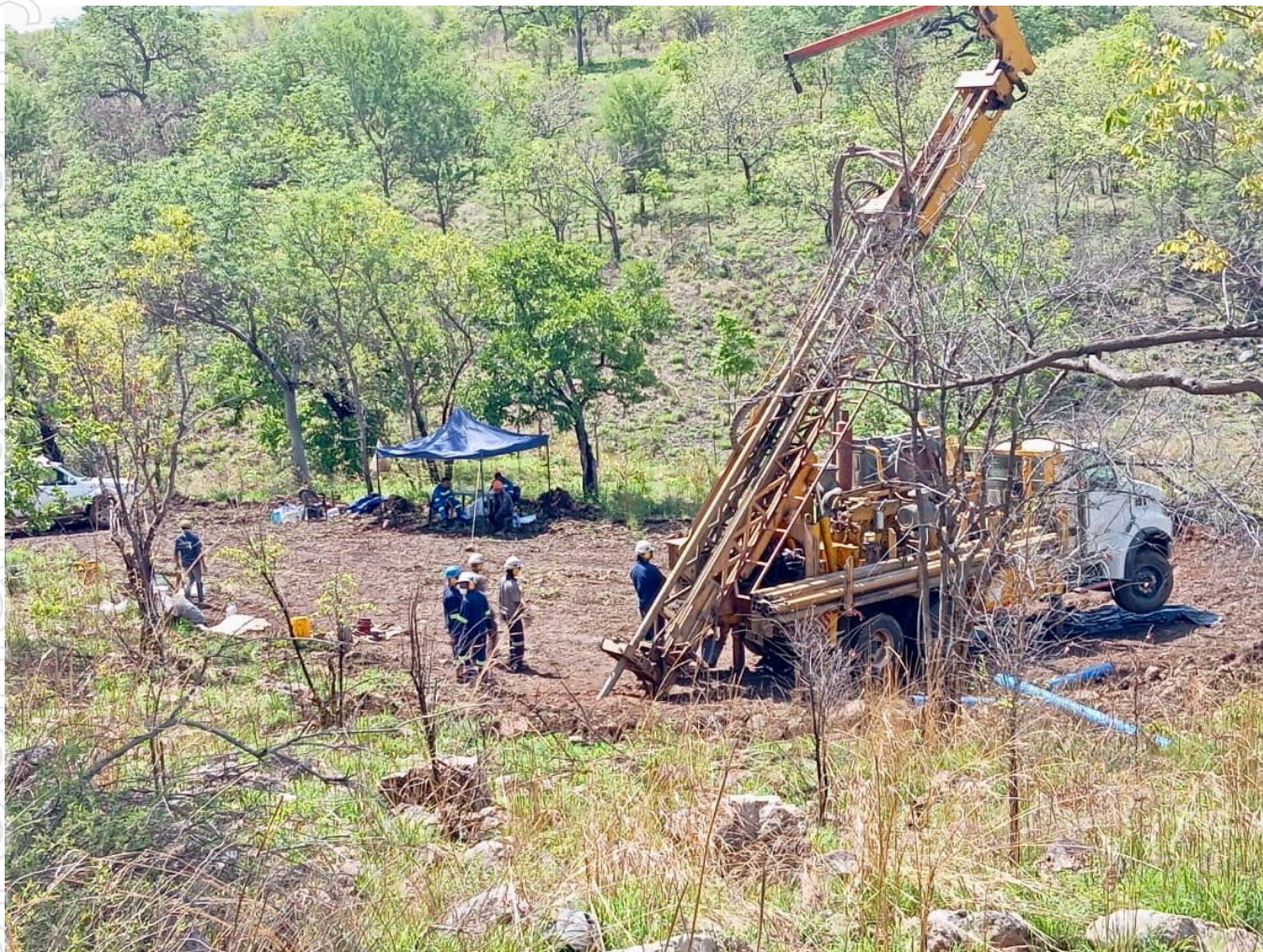
Figure 1. RC rig being established at Han Solo, with local geologists and contractors preparing for commencement of drilling activities.

These early observations are indicative in nature only and will be confirmed following receipt of laboratory assay results. Triton will provide further updates once samples have been submitted and assay results are available.