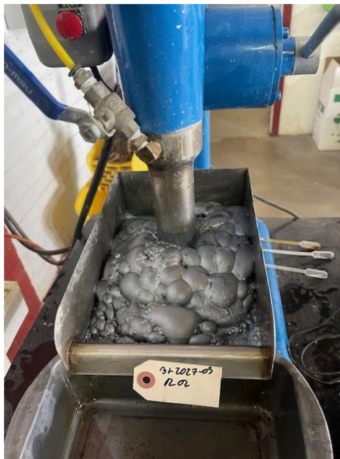
Figure 2; Photo of flotation testwork underway on test R02. Note grey colour of the bubbles is due to stibnite.