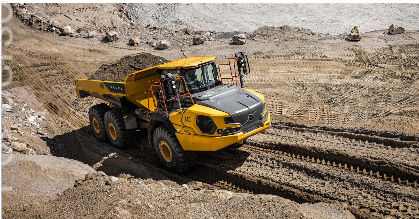
Figure 4: Volvo articulated dump truck