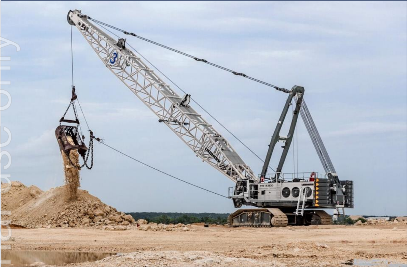
Figure 1: Example of a dragline excavator in action