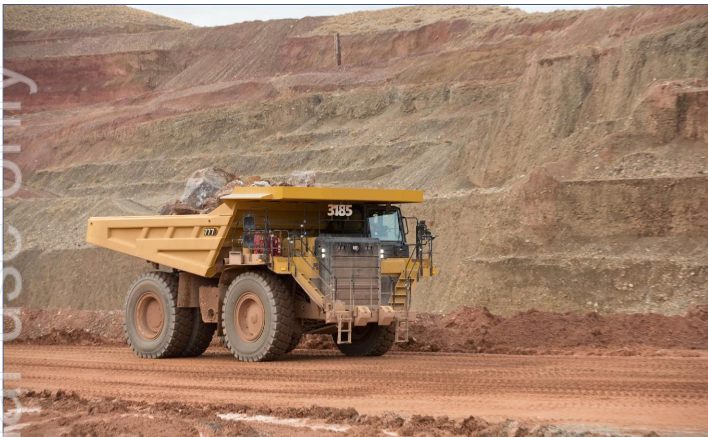
Figure 3: Cat® 777 100-ton mining trucks in action