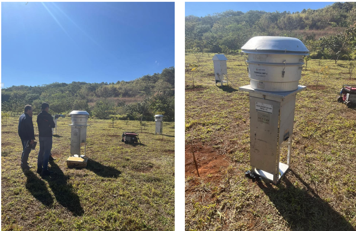
Figure 2 – Photos of stations for air quality monitoring at the Araxá Project.

The efficient completion of this environmental study work underpins to expedite permitting of a potential mining operation.