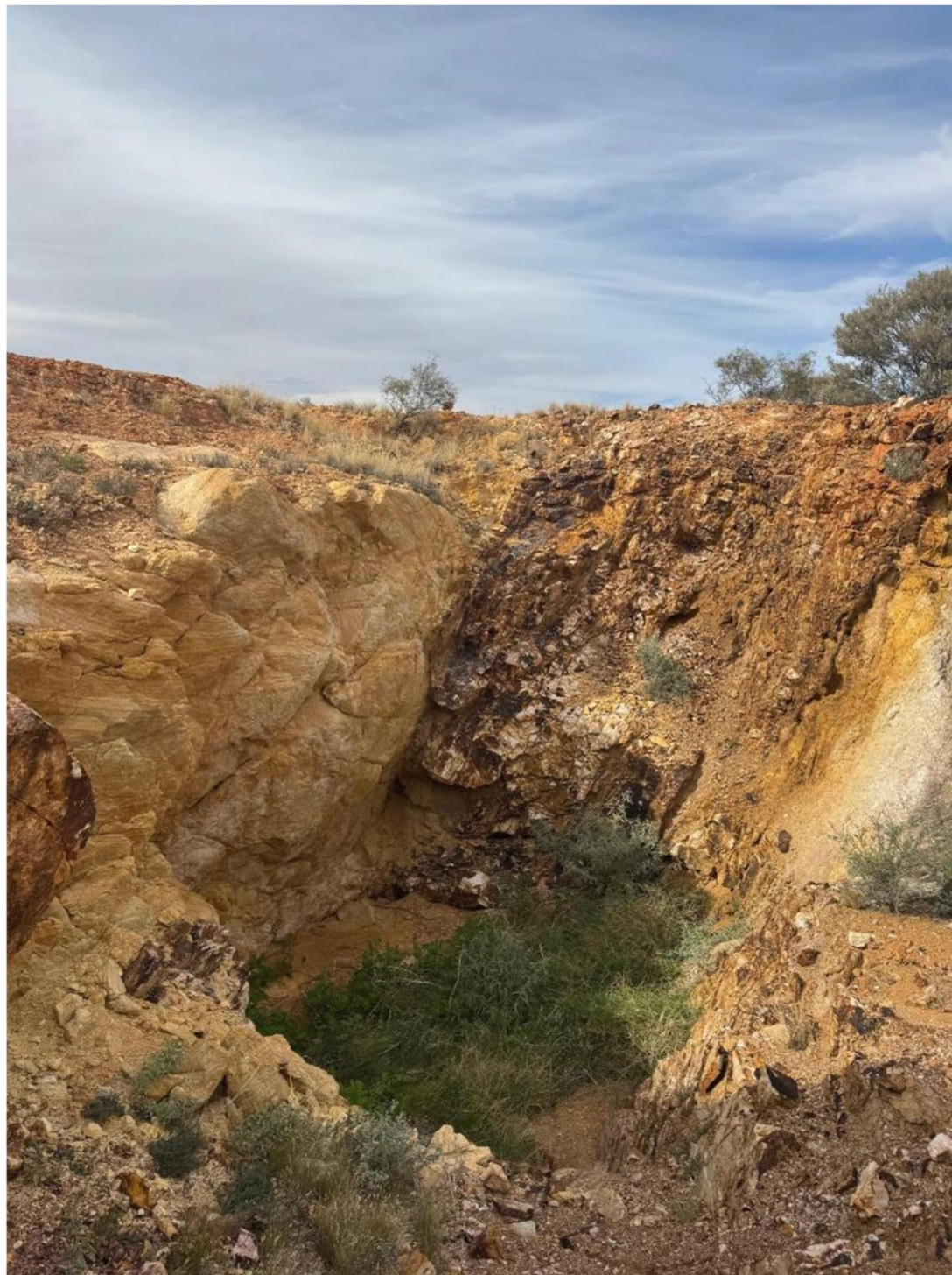
Figure 2: Historic workings at Garden Well, part of the Craig's Rest prospect (316,396mE 6,868,214mN GDA94 z51), within the Leonora Goldfields Project.