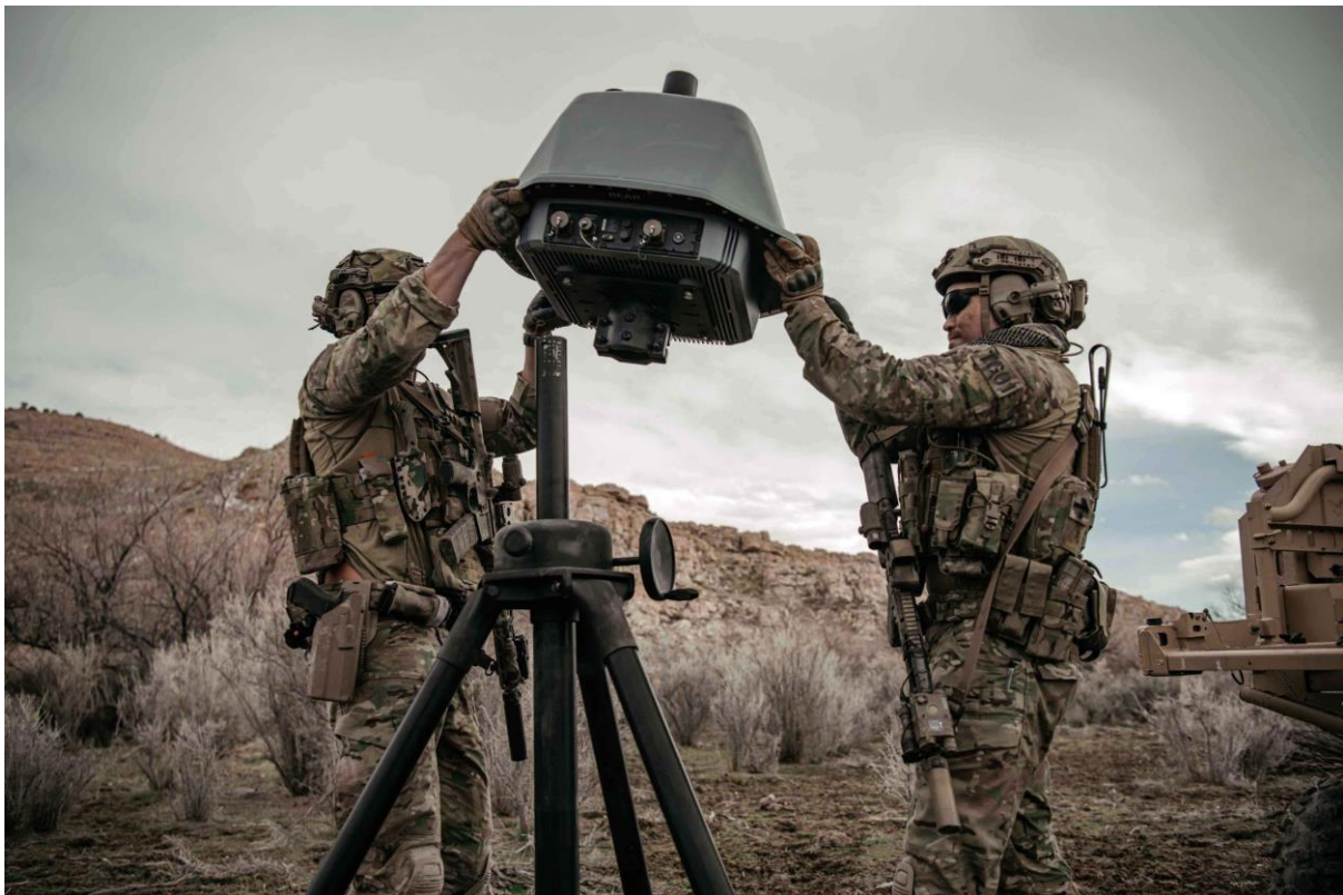
Image: DroneShield DroneSentry-X Mk2 counterdrone system

DroneShield has previously received 2 standalone contracts from this reseller for this defence customer in December 2024 and January 2025 totalling approximately $10.8 million, with all imports, deliveries, and payments handled on-time and in a highly professional manner. There is no obligation for any additional contracts from this reseller or the customer.