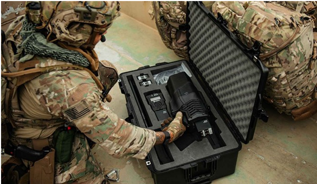
Image: DroneShield Immediate Response Kit

Over the past 24 months, DroneShield's reseller involved in this package of contracts has progressively increased DroneShield orders from single evaluation units to multi-million dollar contracts, with all imports, deliveries, and payments handled on-time and in a highly professional manner. DroneShield had previously received a single contract from this reseller for this specific customer in April 2024 totalling approximately $0.5 million. There is no obligation for any additional contracts from this reseller or the customer.