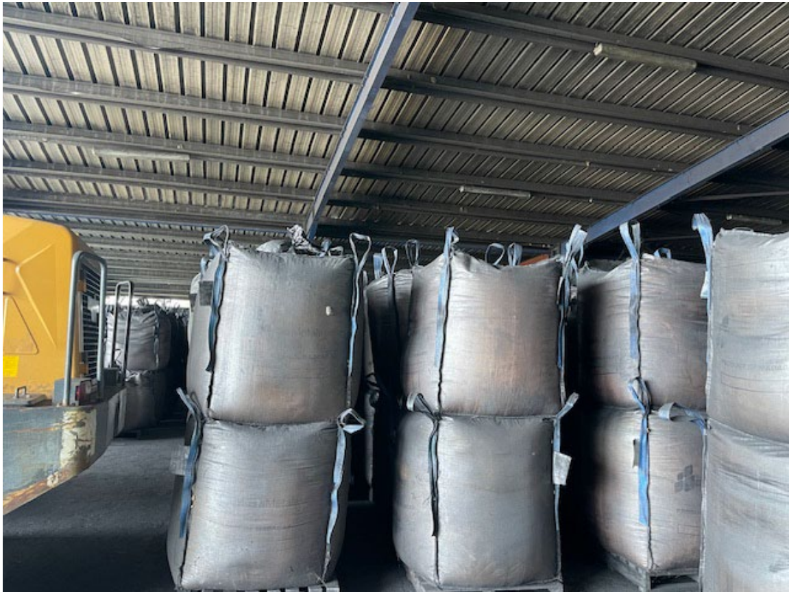
Figure 4 Dried graphite stock in product store