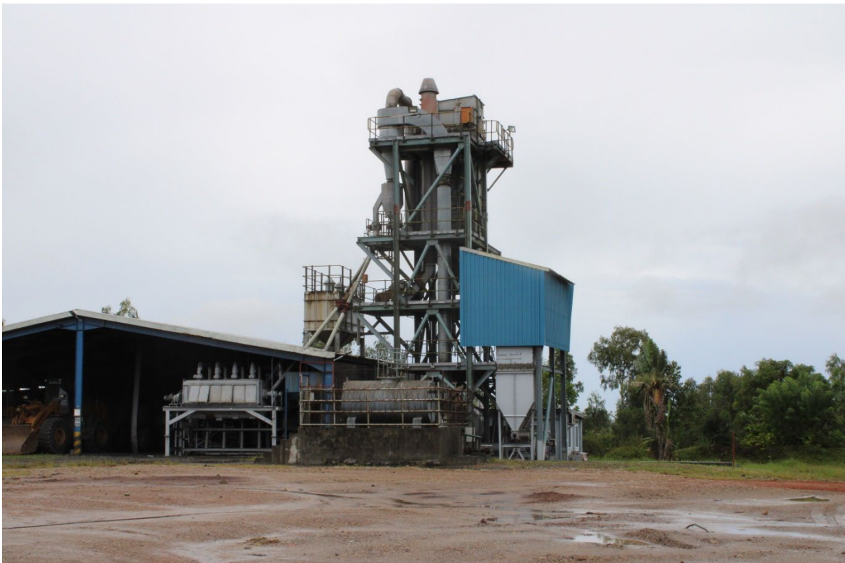
Figure 8 Graphite dryer and equipment stores