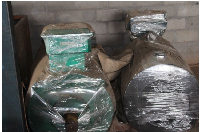
Figure 3 Spare ball mill motors