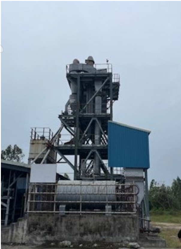
Figure 2 Graphite concentrate dryer