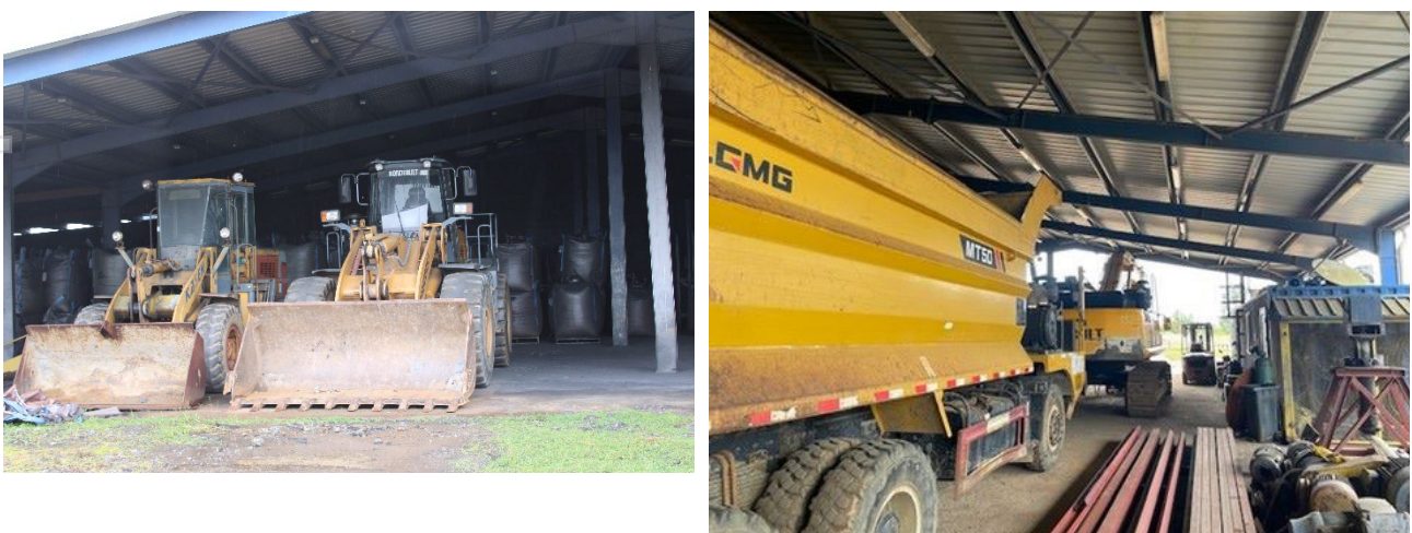
Figure 1 Mobile plant and equipment

The Graphmada site has been well maintained over the care and maintenance period with all access roads, plant and infrastructure in good repair. Whilst at site Greenwing executives conducted a review of all equipment in stores and have identified considerable excess stock that the Company intends to monetise over the coming quarters. The Company holds a comprehensive inventory of yellow goods, spare mill motors, critical spares, grinding media and parts, some of which can be seen below.