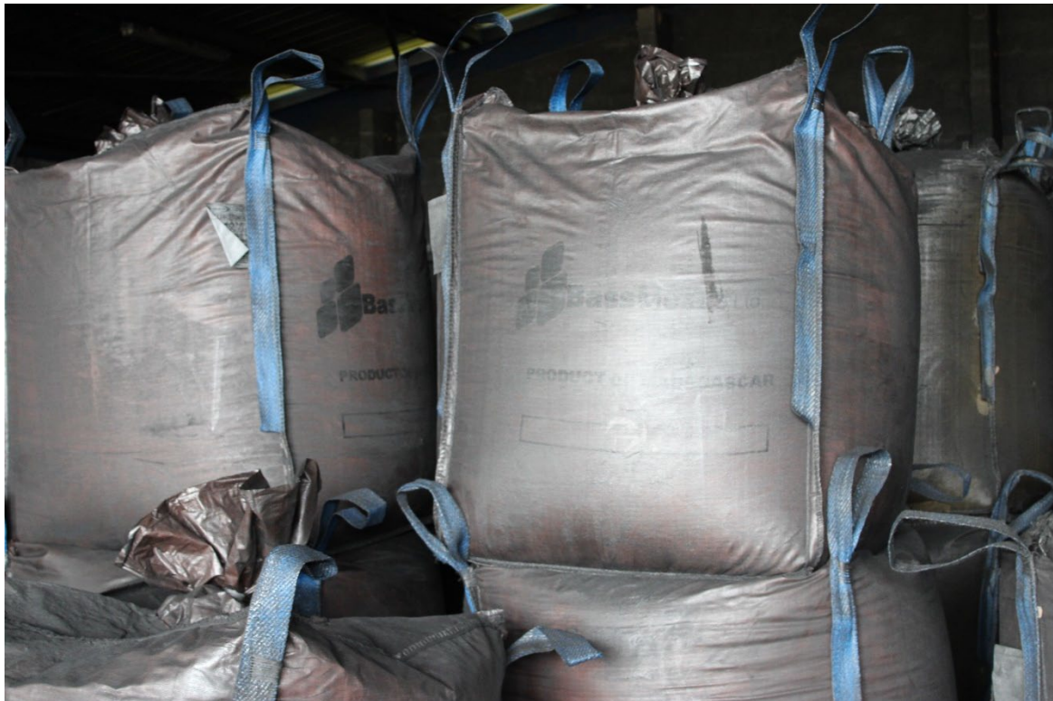
Figure 5 Dried graphite stock in store