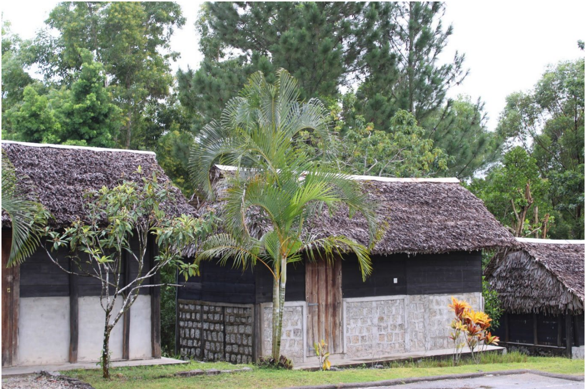
Figure 7 Graphmada staff accommodation