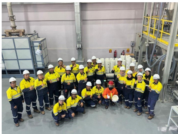
Lynas Malaysia team with first Dy production

https://youtube.com/shorts/18XalQJRjKw?feature=share