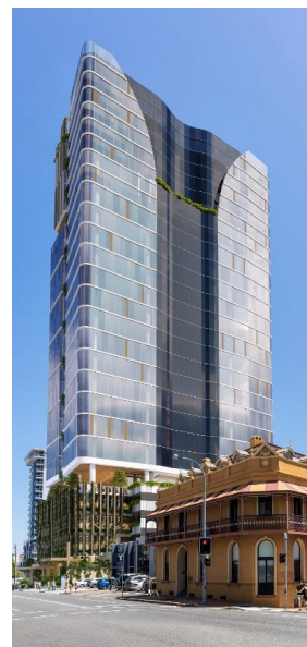
Conceptual Commercial Design

HGL remains focused on assessing the highest and best use for its current property portfolio, to optimise cashflow, reduce costs, take advantage of opportunities to strengthen its strategic positioning for future growth and enhanced returns to shareholders.