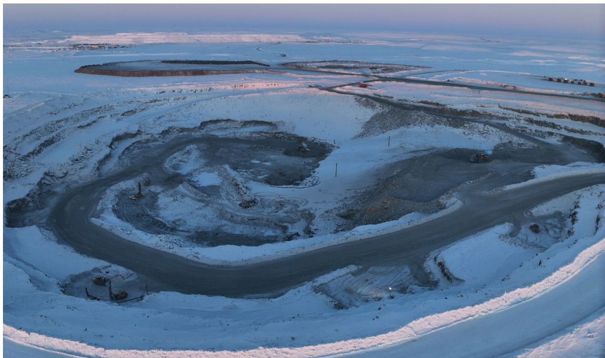
Figure 3 – Point Lake mine operations in Q1-2025, showing the waste rock storage area (top) and the upper benches in the open pit (bottom).

The Company is on track to deliver its first Burgundy mine plan by the end of Q2-2025. Burgundy will release the longer-term mine plan in the second half of the year. This plan could extend the life of mine to the mid-2030s.