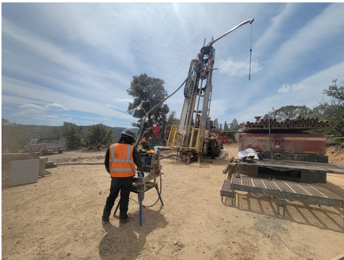
Figure 1 – 2025 Drilling operations at Maverick Springs