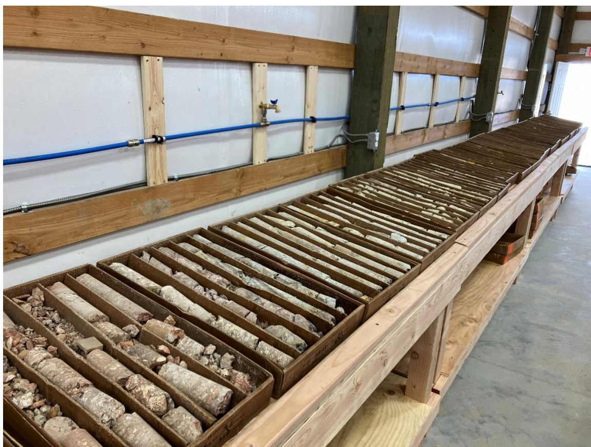
Figure 2 – Sun Silver's Elko core facility