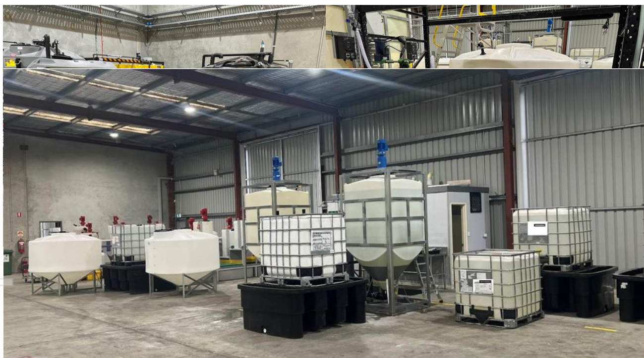
Figure 1. The HiPurA pilot plant: note the filtration units still in wrappers.