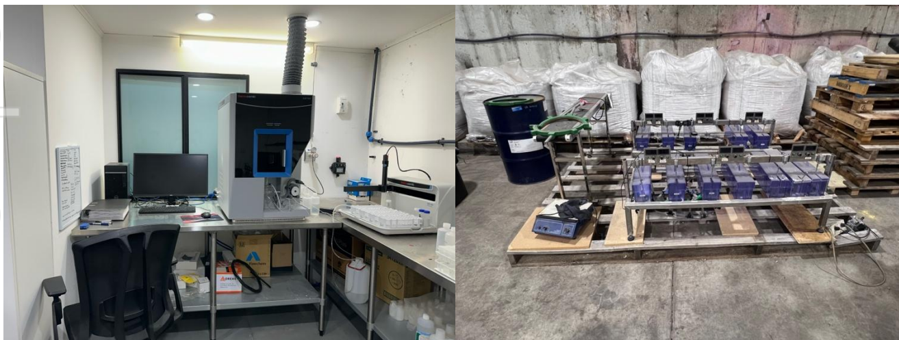
Figure 2 (L). ICP analytical machine capable of reading up to 66 elements to ppb levels of detection.