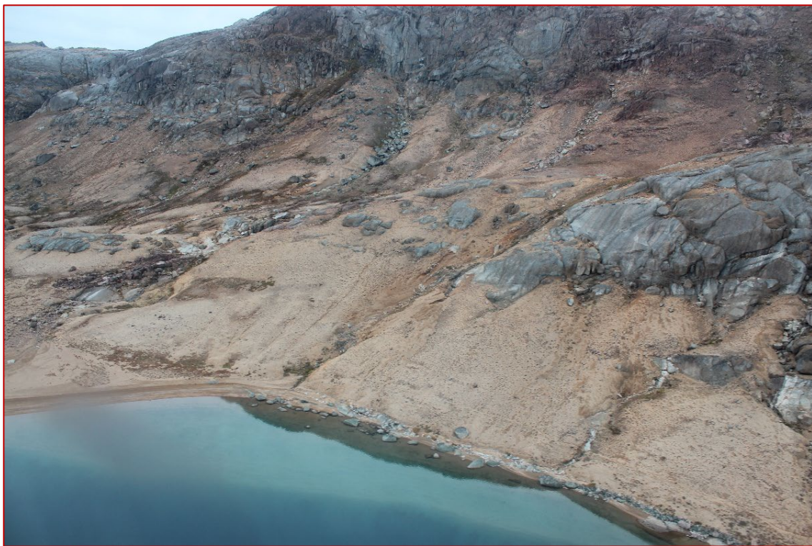
Figure 3: Colluvial and alluvial weathering accumulations from granitic country rock surrounding Blue Lake.