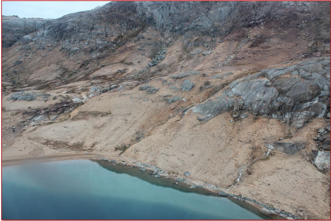
Figure 3: Colluvial and alluvial weathering accumulations from granitic country rock surrounding Blue Lake.