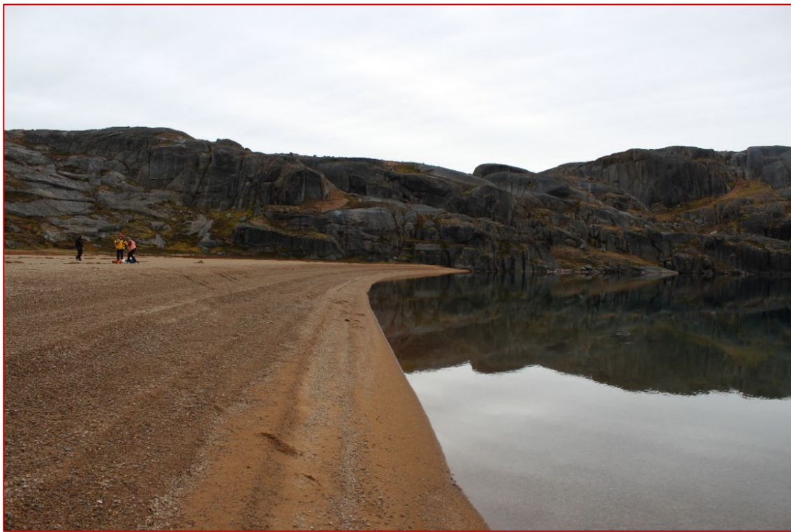
Figure 4: Coarse crystal rich 'beach' at Blue Lake.