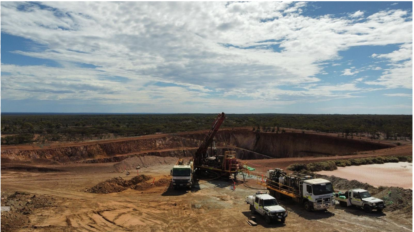
Figure 1 – Drill Rig at Eureka

"We are also progressing our studies and discussions with nearby mill operators about mining the ~34,000oz at the southern end of the pit. Given the current record A$ gold price, this has the potential to generate substantial near-term cashflow".