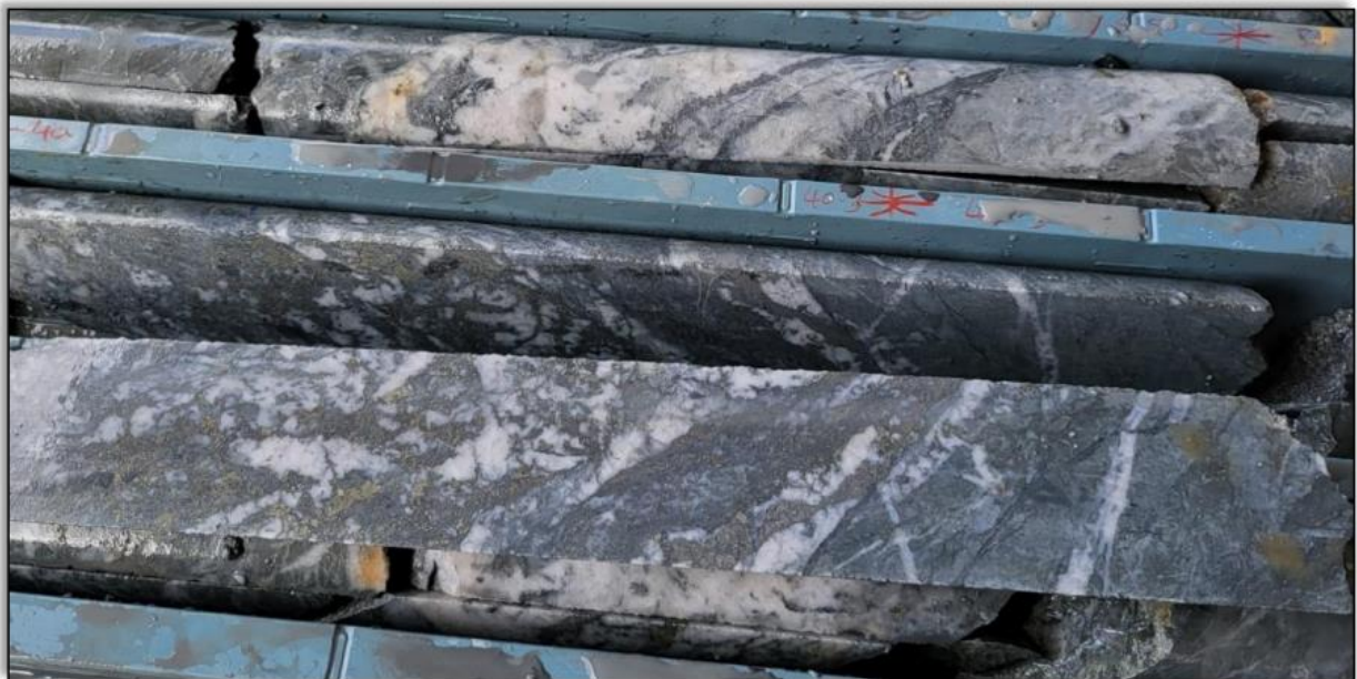
Figure 1. Haunted Stream drilling 2 , ERN001 from 39m with laminated quartz-sulphide vein and brecciated sulphidic sandstone. The hole intersected 13m @ 3.57 g/t Au from 39m.

These zones provide high-priority targets for upcoming drilling , with the aim of expanding mineralised zones and testing depth continuity beneath known high-grade zones.