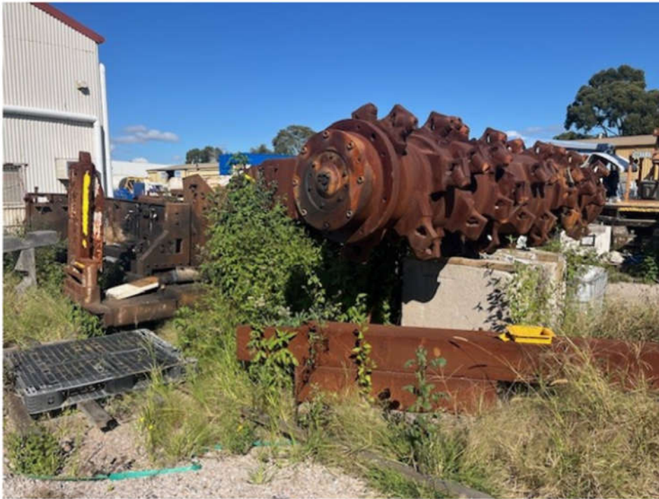
Continuous Miner pre overhaul, Kurri Kurri (NSW) facility.