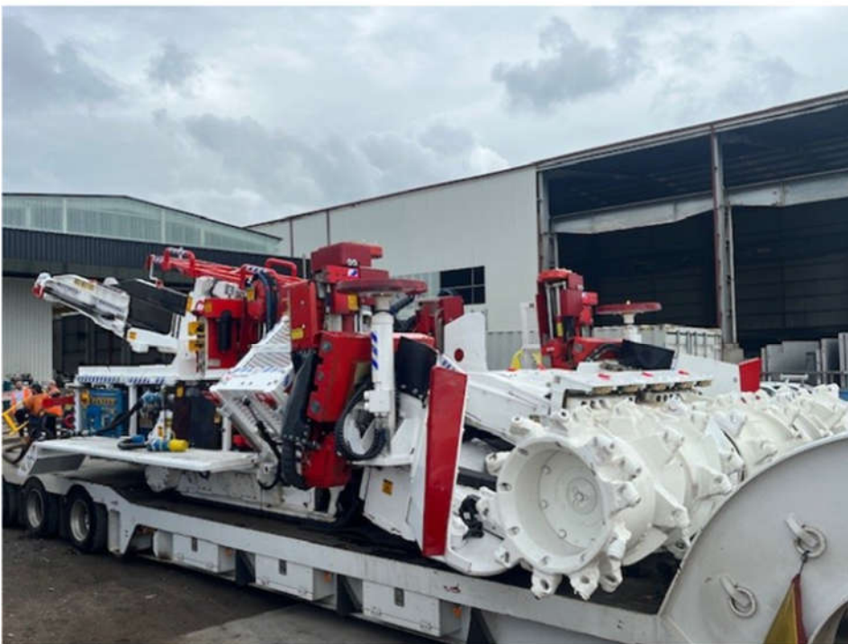
Continuous Miner post overhaul and ready for delivery to Malabar, Kurri Kurri (NSW) facility.