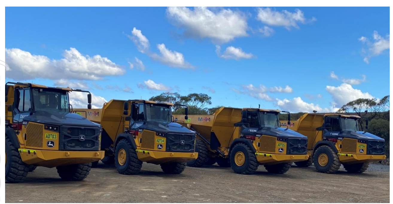
Photo 1: MHM Contracting 40-tonne Moxy dump trucks on site at Munda Gold Mine.