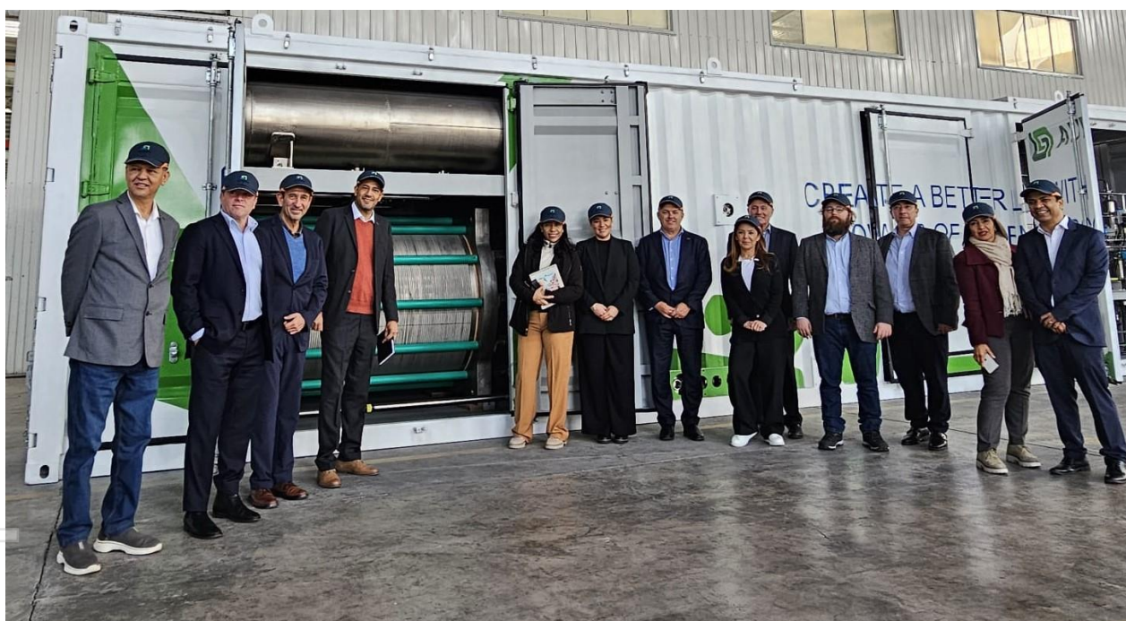
Image 1: Pure Hydrogen team and GreenH2 LATAM delegation inspecting an electrolyser

These initial projects represent just the beginning of what we anticipate to be a strong and sustained demand from the region. As we continue to enhance the design and cost-effectiveness of our hydrogen equipment, we are confident in our ability to meet the accelerating global shift towards clean energy. We expect further orders and sales to follow particular for vehicle range. This is especially as some competitors have pull out of the market creating a tremendous opportunity."