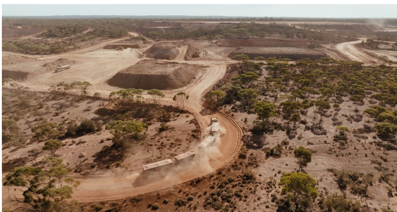
Figure 2: Ore Stockpiles on West ROM at Boorara

A further mining and processing update is expected in the Company's March Quarterly Report.