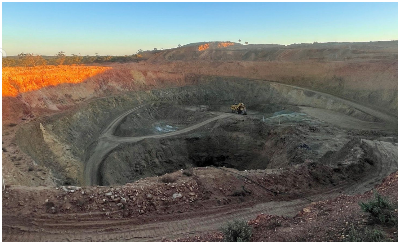
Figure 5: Mining the Newminster pit at Phillips Find

Authorised for release by the Board of Directors