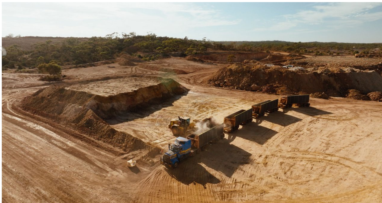
Figure 3: Loading ore at Boorara to transport to the Paddington Mill