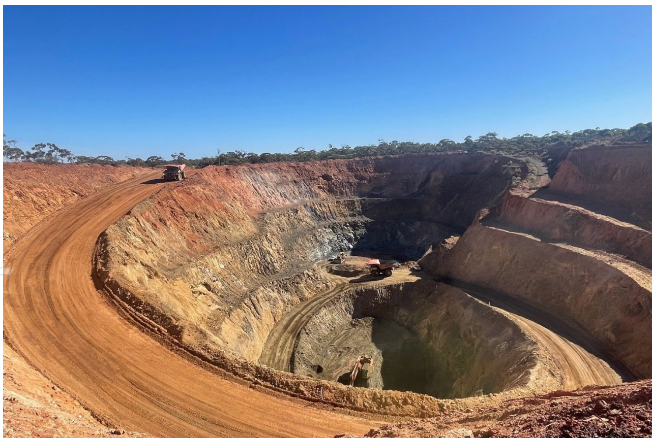
Figure 4: Mining the Newhaven pit at Phillips Find