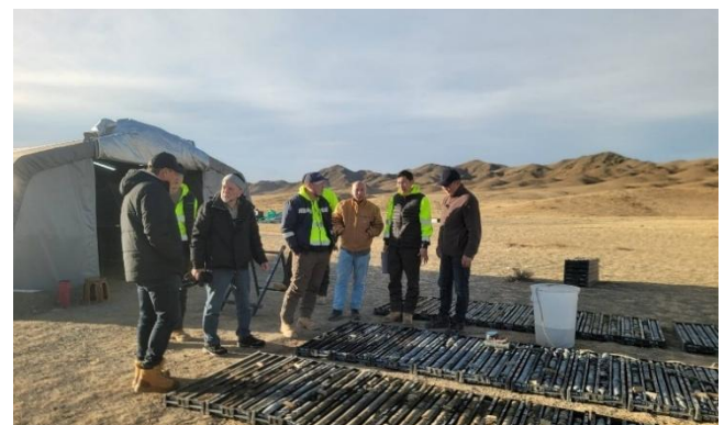
Chairman's Yambat project site visit

Multiple high-grade massive sulphide intercepts were confirmed in the Oval and North Oval areas. Additional analysis of gravity data with new topographic and lithology-based density data has identified potential extensions of the Oval mineralisation to depth. Further analysis is ongoing and substantial work is planned for the year ahead.