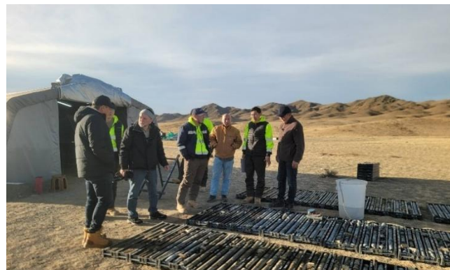
Chairman's Yambat project site visit

Multiple high-grade massive sulphide intercepts were confirmed in the Oval and North Oval areas. Additional analysis of gravity data with new topographic and lithology-based density data has identified potential extensions of the Oval mineralisation to depth. Further analysis is ongoing and substantial work is planned for the year ahead.