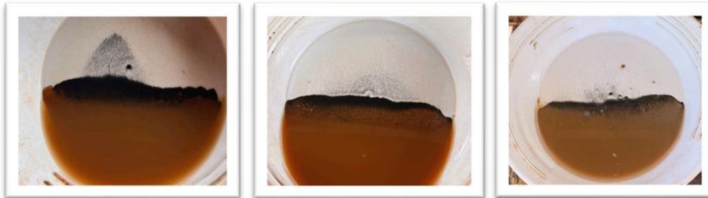
Figure 1: HM in drillholes - Left Image MM01, central image MM06, right image MM57