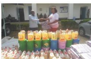
School supplies donations