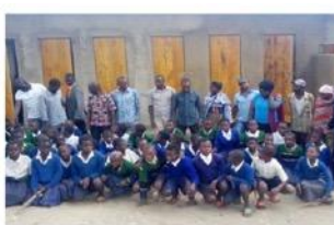
New primary school facilities