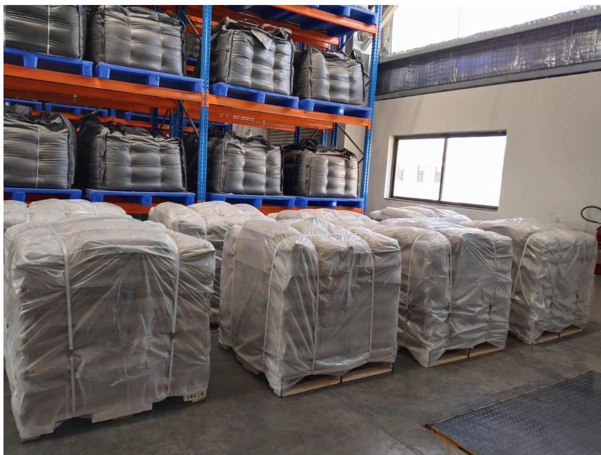
Figure 2 – Expandable graphite recently packed in 25 kg bags and shipped with other material to be repacked (background)