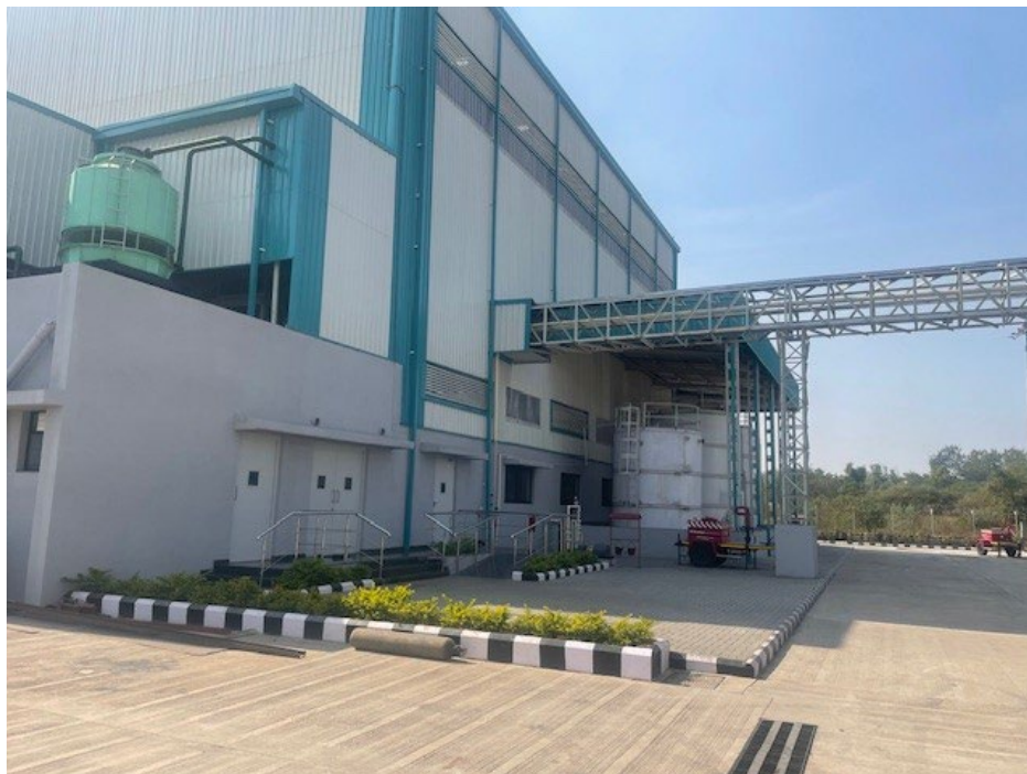
Figure 1- Outside of main processing centre at PGT operations