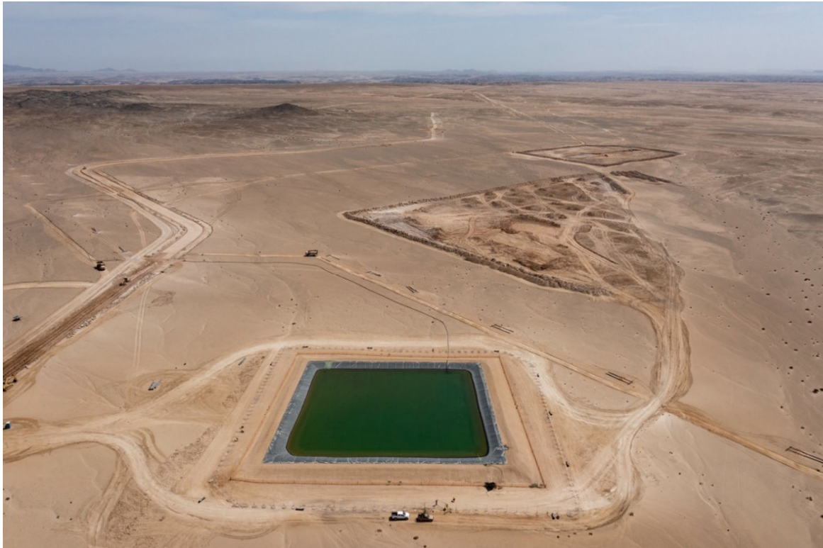
Figure 2: Completed construction water storage dam

FOR THE HALF YEAR ENDED 31 DECEMBER 2024