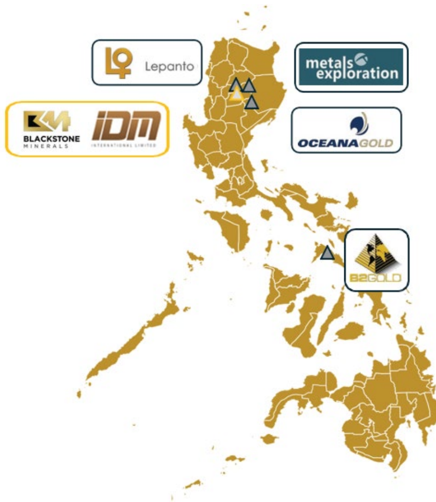
Figure 3 Philippines Mining Operations

Mankayan benefits from its location in the Philippines, a nation with a pro-mining regulatory environment and a long-standing history of successful mining operations (e.g., B2 Gold, OceanaGold). Importantly, the IDM team has materially progressed its social license to operate in Mankayan, ensuring positive relationships with local stakeholders. The Philippines' openness to mining operations, combined with a skilled workforce and existing infrastructure, provides a strong foundation for the project's development.