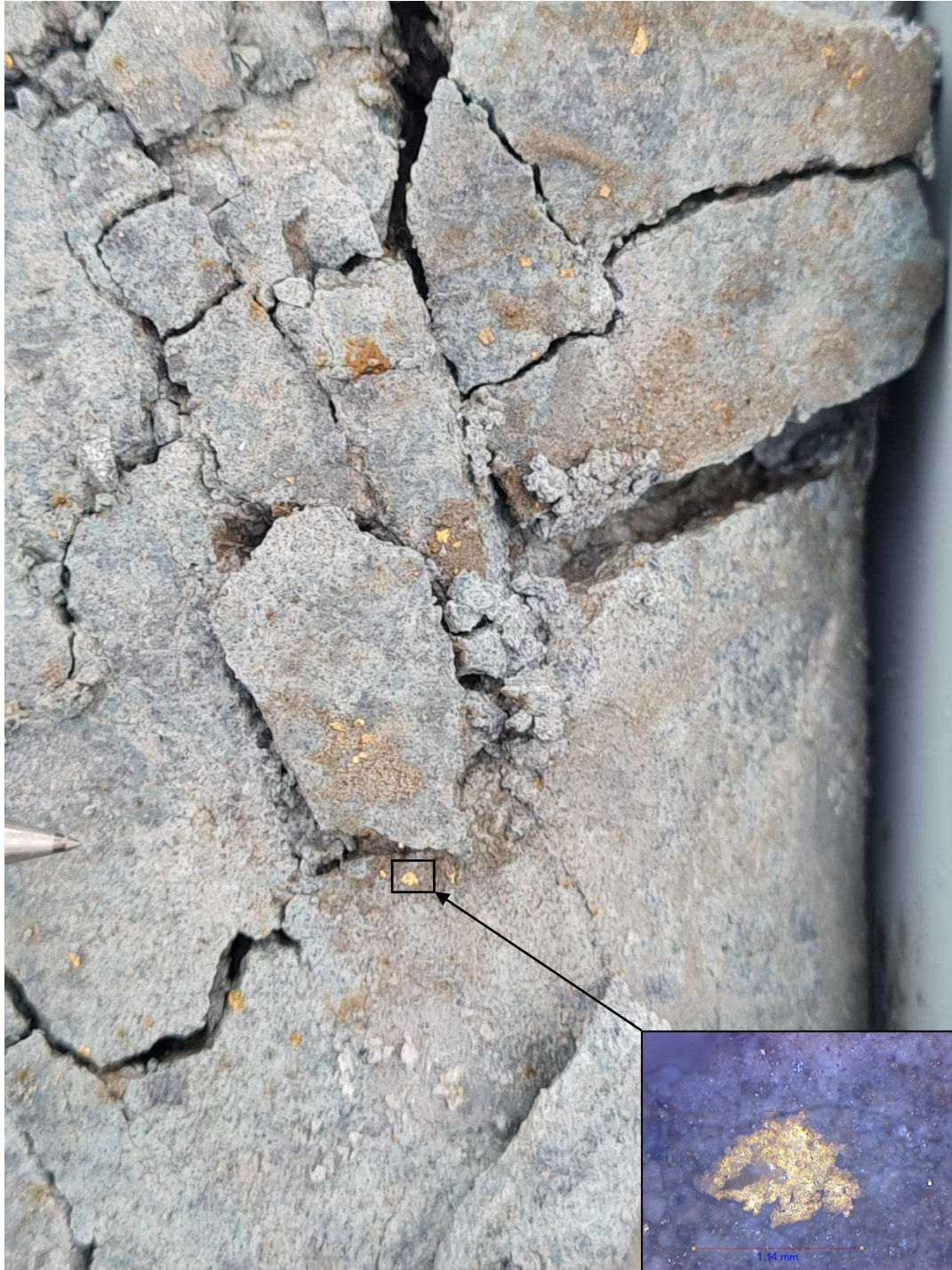
Figure 2 Visible gold identified in diamond drill hole (CDH-62)

To watch a video summary of the announcement click here