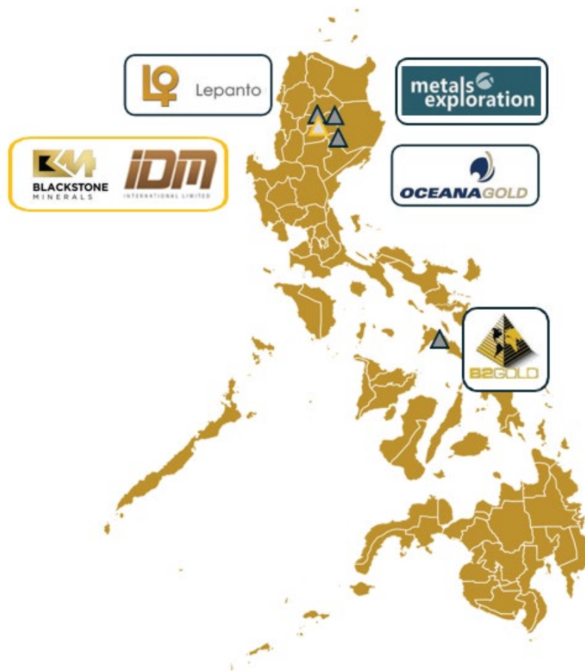
Figure 3 Philippines Mining Operations

Mankayan benefits from its location in the Philippines, a nation with a pro-mining regulatory environment and a long-standing history of successful mining operations (e.g., B2 Gold, OceanaGold). Importantly, the IDM team has materially progressed its social license to operate in Mankayan, ensuring positive relationships with local stakeholders. The Philippines' openness to mining operations, combined with a skilled workforce and existing infrastructure, provides a strong foundation for the project's development.