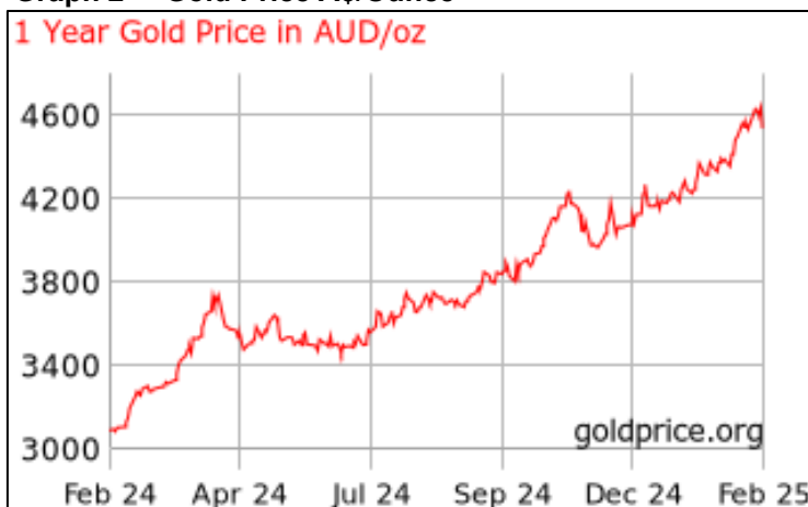
Graph 2 Gold Price A$/Ounce