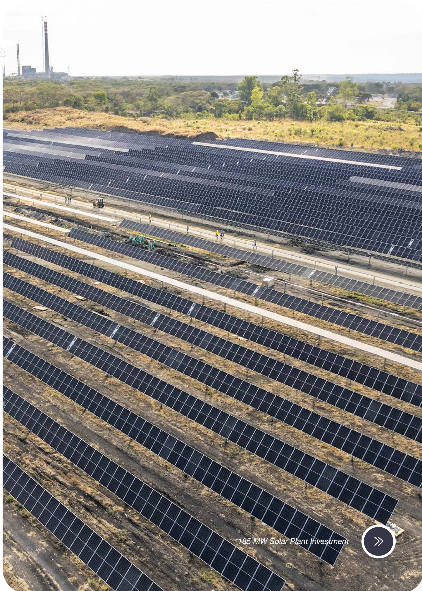
185 MW Solar Plant Investment