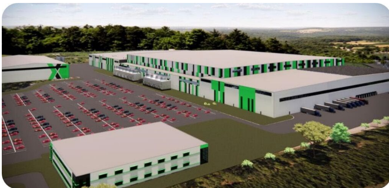
Figure 2 Site Rendering of NOVONIX Enterprise South

NOVONIX Enterprise South (NES), together with NOVONIX's existing 20,000 tpa facility at Riverside in Chattanooga, is planned to bring the Company's total production capacity to over 50,000 tpa by 2028.