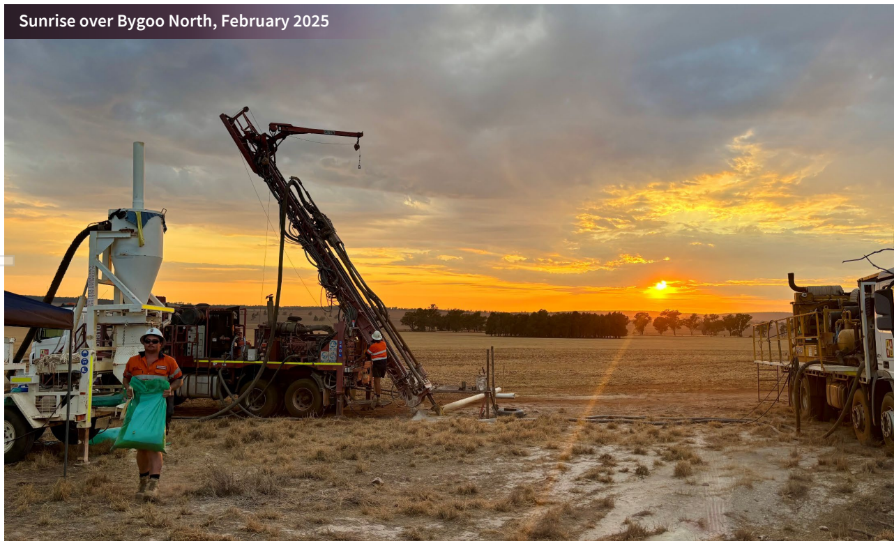
Sunrise over Bygoo North, February 2025

Caspin Resources Limited (Caspin or the Company) (ASX: CPN) is pleased to provide an update on exploration activities at its 100% owned Bygoo Tin Project in New South Wales. The Company's maiden RC drilling program has now commenced and is expected to run for several weeks.