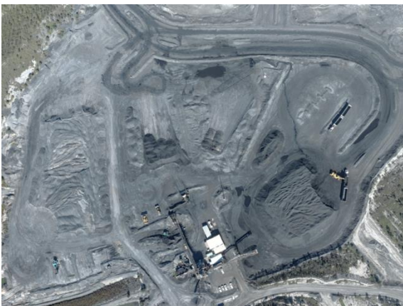
Blair Athol Coal Handling and Preparation Plant