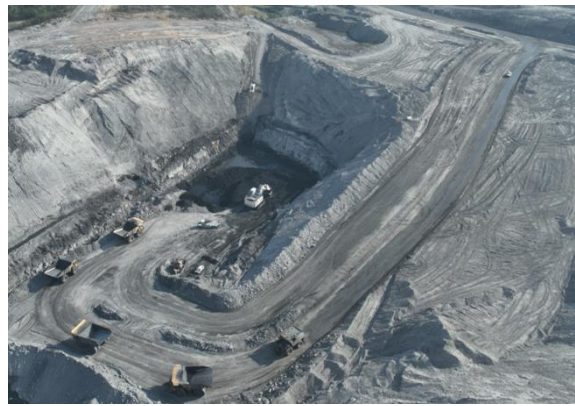
Blair Athol Coal Mining