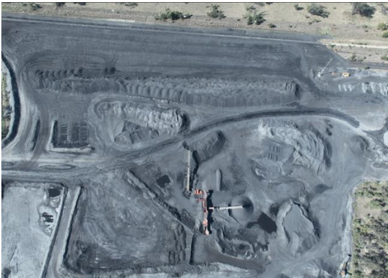
Blair Athol Crushing and Train Load Out

BA mine pictures at end of December 2024