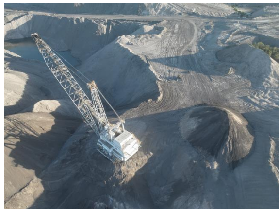
Blair Athol Dragline