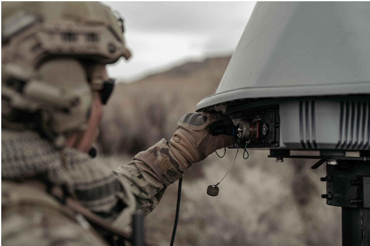
Image: DroneShield counter-UxS detect and defeat system