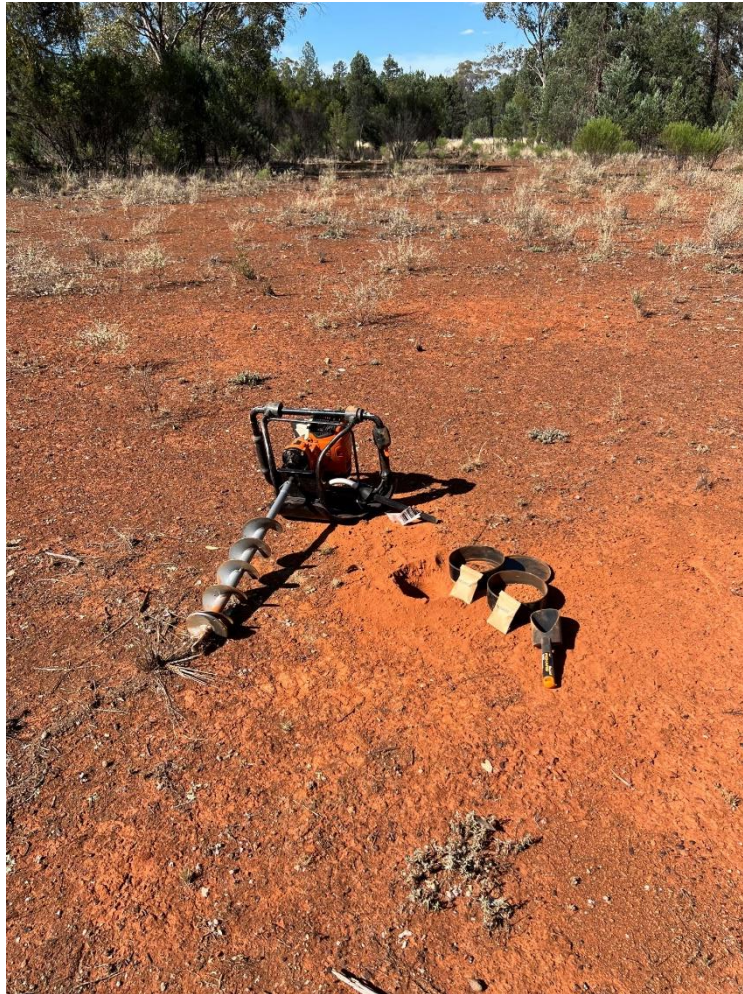
Figure 3: A sample location at Mount Hope East prospect.