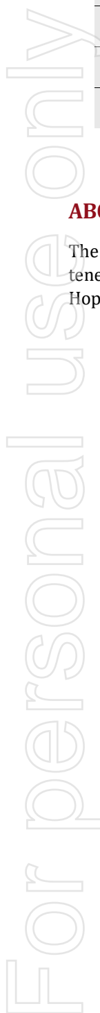
ABSTRACT The tenet of Hop