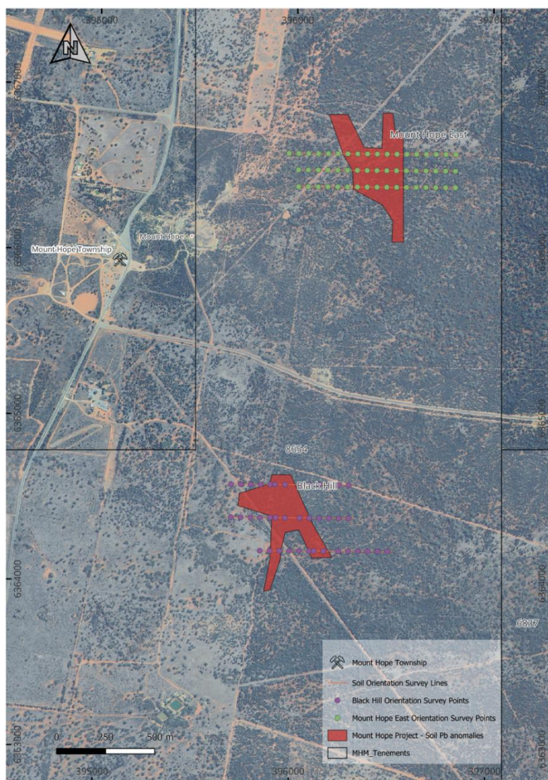
Figure 2: Soil orientation survey lines over target lead anomalies.

The survey consisted of collecting a standard 120 Micron fraction soil sample at each sample location which will be assayed via Aqua Regia digest for multielement analysis (Figure 3). The company also completed Portable XRF (pXRF) analysis to produce indicative infield results to assist with program execution.