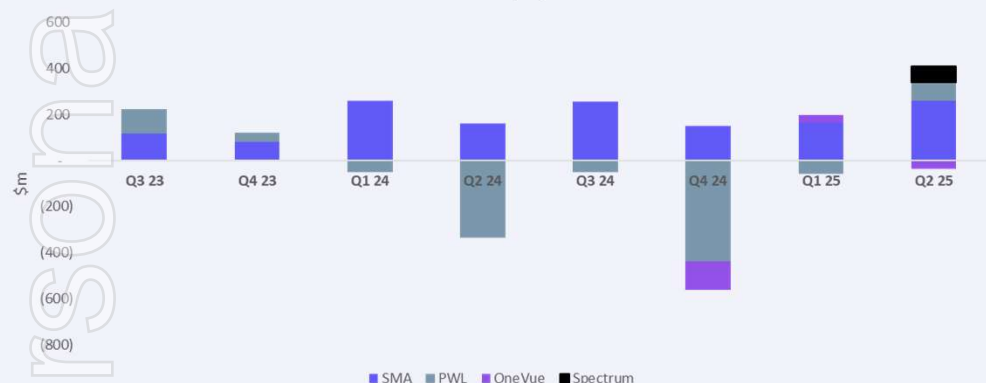
Net Flows by Quarter