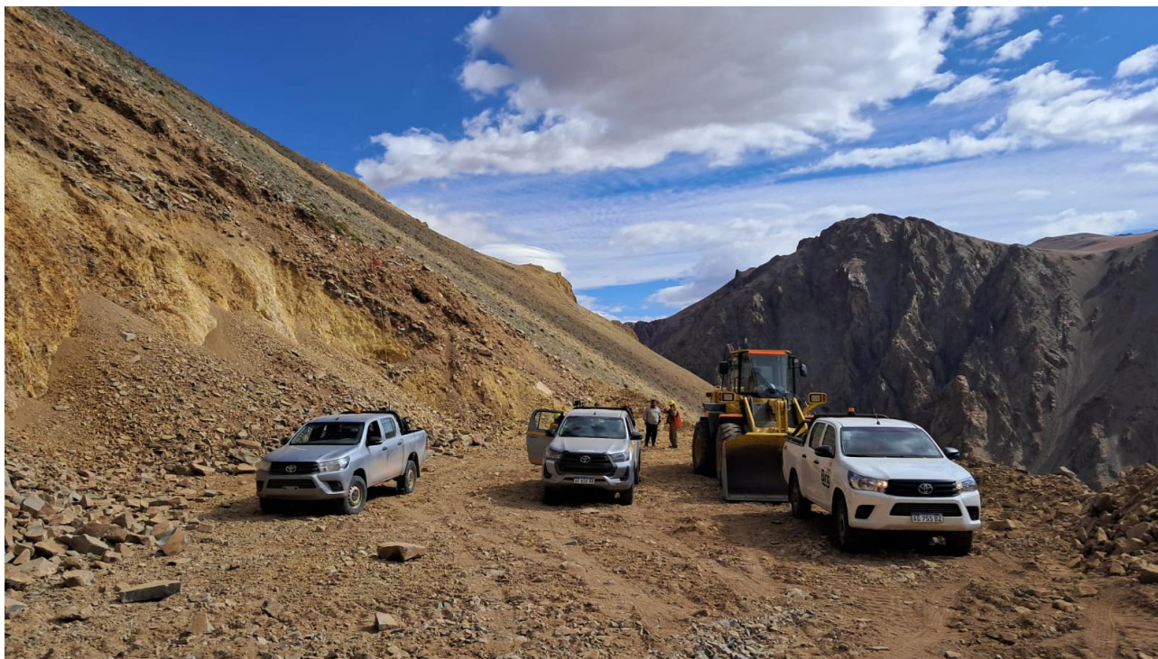
Figure 1 – Malambo Drill Pad 1.