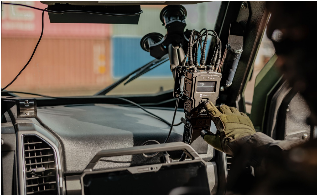
Image: DroneShield C-UxS system in a vehicle