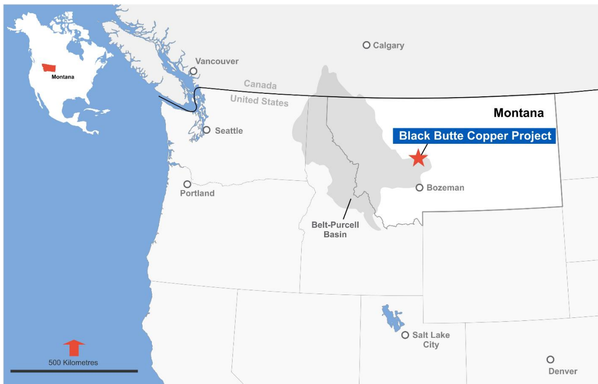
Figure 1: Black Butte Project Location

Situated on private ranch land in Meagher County, the project is near road, power, and rail infrastructure. It promises job creation and economic benefits for the local community while protecting the watershed.