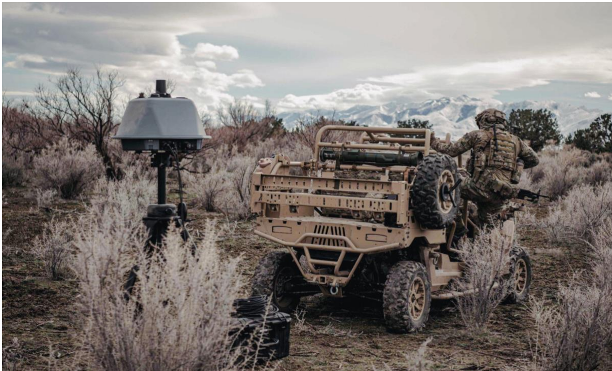
Image: DroneShield Expeditionary Fixed Site (EFS) drone detect and defeat system

“DroneShield is unique globally in that we can provide an entire ecosystem of dismounted, vehicle and fixed systems and link them all together.”