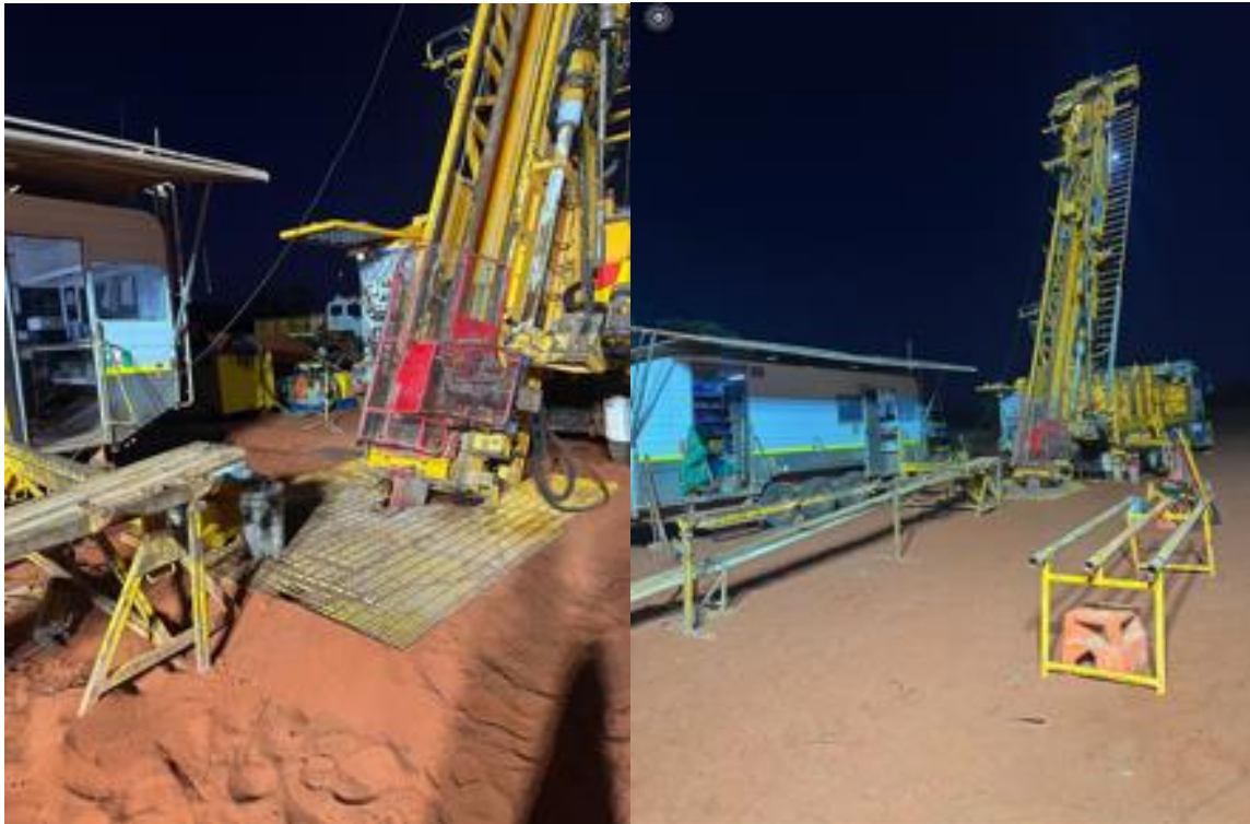
Figure 2: Diamond drilling at the Abercromby Project commenced on 3 December 2024.